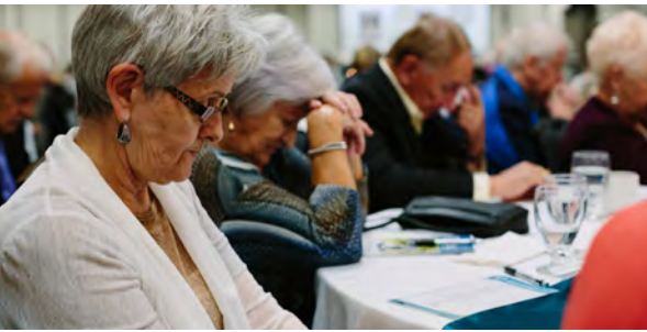
People from all over the Lower Mainland joined in prayer for Tabor's new building project.